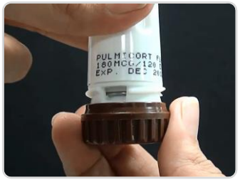
Step3: Rotate the grip completely back in the other direction. You'll hear a click.