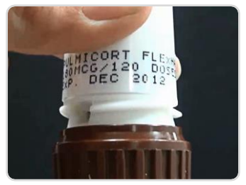
Step2: Rotate the brown grip in one direction.