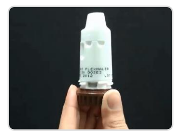
Step1: Hold the Flexhaler straight up. Rotate the cover and remove it.