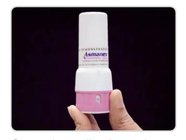
Step7: Immediately put the cap back. Rotate in clockwise direction and gently press down. You'll hear a click.